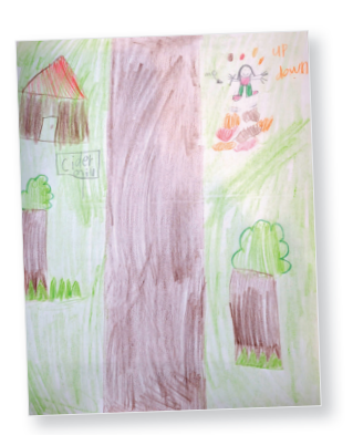
Alyssa, Age 8

We received some amazing artwork for our "Favorite Fall Activity" Contest!