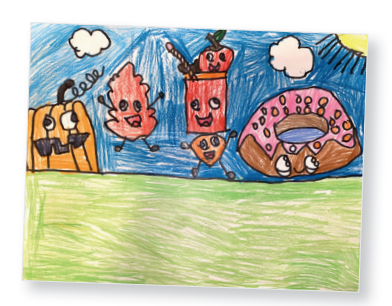
Tommy, Age 7